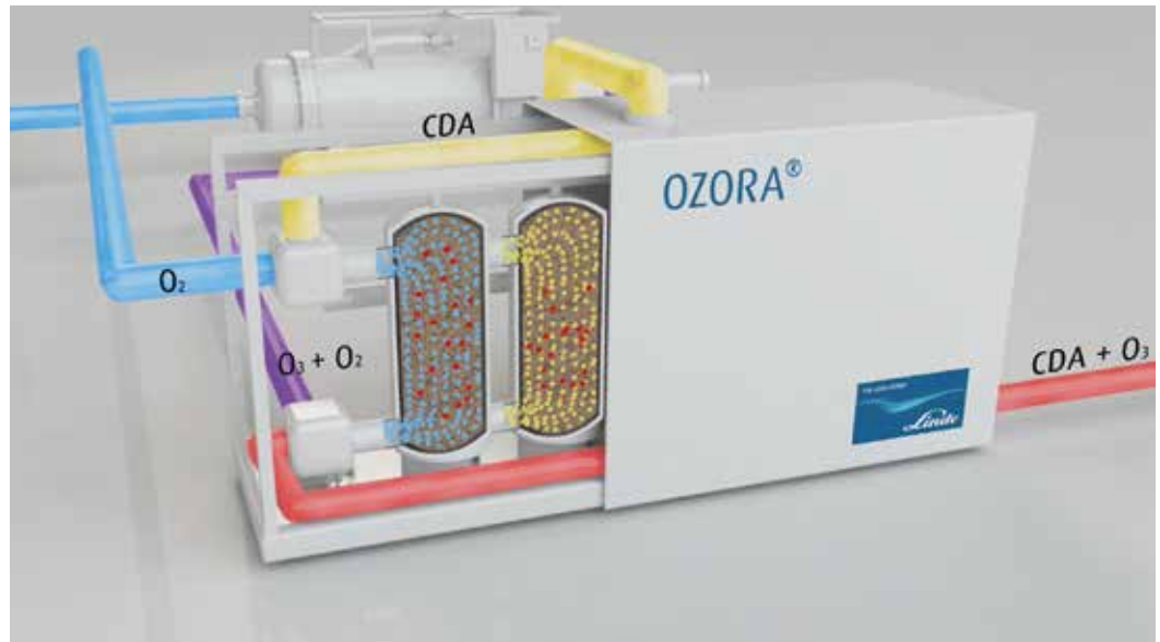
Illustration of OZORA's adsorption and desorption process.